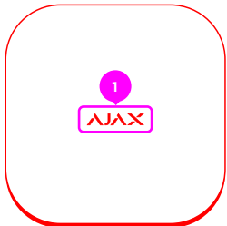
1 - Logo with a light indicator.